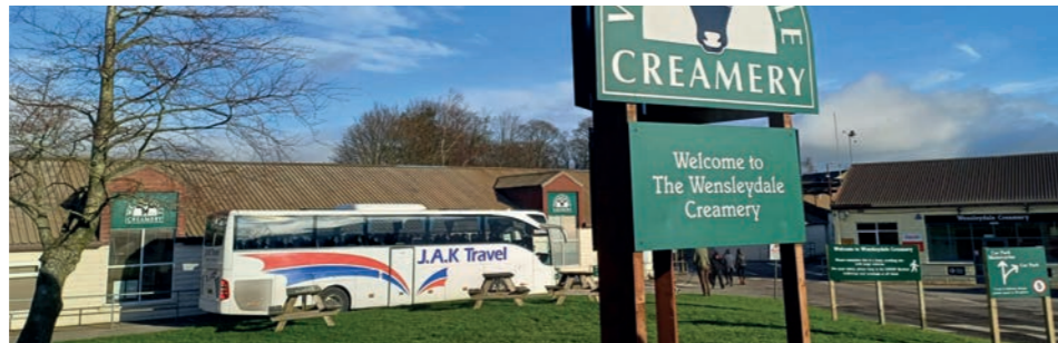
A visit to Wensleydale Creamery