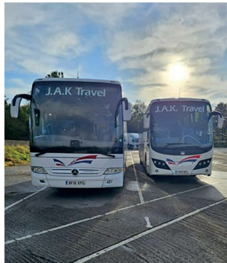
Part of our fleet