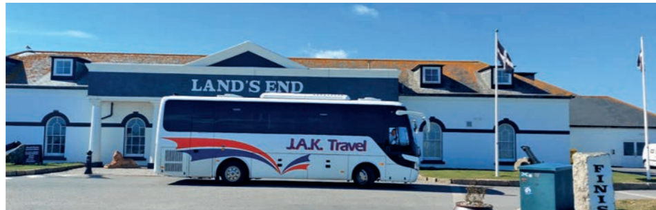
Long haul to Land's End